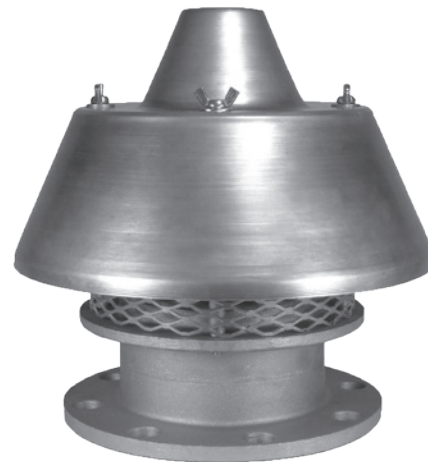
Figure 1. Rim Vent Pressure Relief Valve

Failure to correct trouble could result in a hazardous condition. Call a qualified service person to service the unit. Installation, operation and maintenance procedures performed by unqualified person may result in improper adjustment and unsafe operation. Either condition may result in equipment damage or personal injury. Only a qualified person must install or service the pressure relief valve.