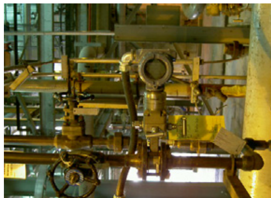
Rosemount 3051S Differential Pressure Transmitter with 405P Compact Orifice

Reduced engineering, procurement and installation costs were achieved with the 405P, which integrates the manifold, connection hardware and primary into a single cast part.