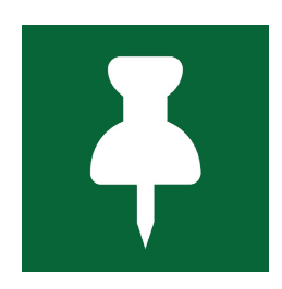
Pinpoint Problems & Root Causes