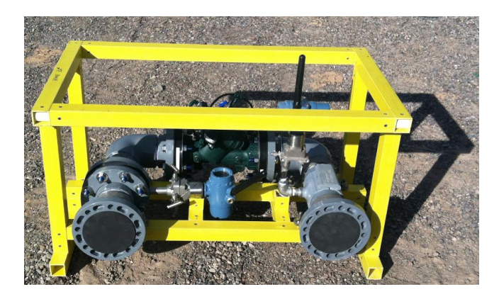
Figure 1: Instrumentation skid

modules in operation at a given time. Implementing such a system on this large of a scale required overcoming a whole different set of challenges, which included materials of construction, portability, power requirements, wireless operation, and cost/benefit considerations.