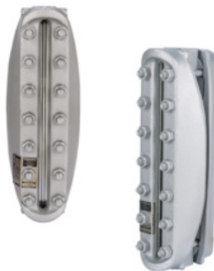
High / Low Pressure Flat Glass Gauges