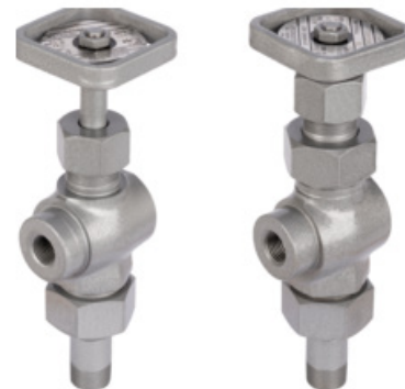
Flat Glass Gagecocks